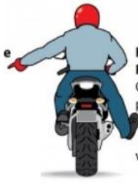
Hazard in Roadway On the left, point with left hand; on the right, point with right foot.