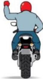
Right turn Arm out, bent at 90° angle, fist clenched.