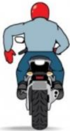
Stop Arm extended straight down, palm facing back.