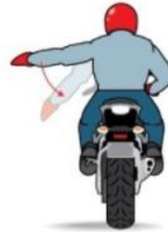
Slow Down Arm extended straight out, palm facing down, swing down to your side.