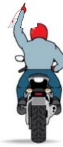
Single File 1 finger over helmet