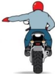
Left turn Arm and hand extending left, palm facing down

These signals replace electronic indicators for turns and communicate hazards, speed changes, and formation adjustments to maintain safety, especially in twisty roads where formations change, always emphasizing checking with your specific group for their adopted signals.