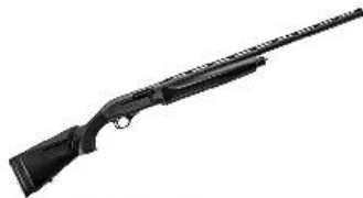
Beretta, A300 Ultima

Help Us Help a Military Member – We Can Make a Difference