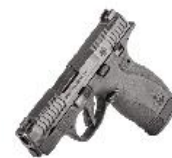
S&W Bodyguard 2.0